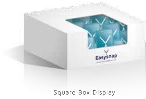
Square Box Display