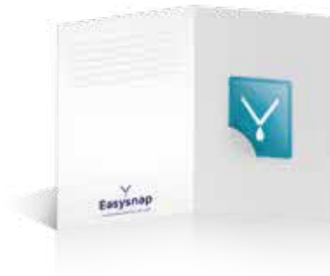
Card & Flyer