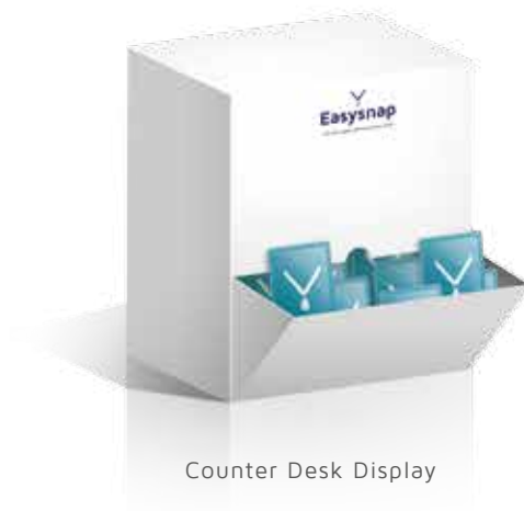
Counter Desk Display

This page will illustrate a few examples of secondary packaging for our Easysnap sachets.